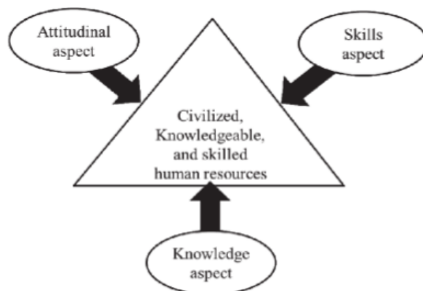
Figure 1. Scientific competencies for school science.

Science does not only consist of facts, laws, and theories, but also involves human activities, such as investigations, processes, attitudes, and beliefs. Science in the domain of knowledge must be factual, conceptual, procedural, and metacognitive (Krathwohl, 2002; Suwanto, 2010). Factual knowledge is an essential component that pupils must recognise by the discipline. The core elements are given following academic science, which is easy to understand and systematically arranged. Conceptual knowledge connects, associates, and combines different essential elements in a systematic and shared common structure. This knowledge can be a scheme, mental model, or explicit and implicit theories in different cognitive psychology. Procedural knowledge emphasises how to make discovery and sets criteria for the use of skills, algorithms, techniques, and methods collectively. Metacognition implies awareness, and responsibility for one's own learning and thinking. Sandoval and Reiser (2004) explain that the epistemology of science comprises not only sources of scientific knowledge and the value utilised to sustain that knowledge, but also the way of knowing handled by the community to accept scientific knowledge.